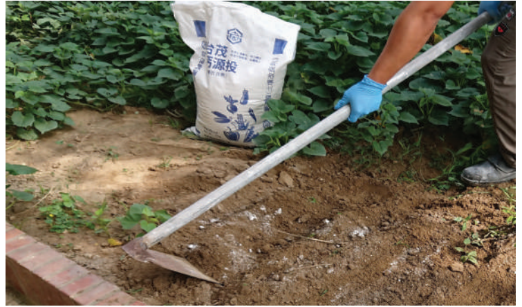
② After Calcium Regenerate is scattered, quickly mix together with the soil.

Calcium Regenerate if used together with nitrogen fertilizer, ammonia gas might be released, which discourages the development of root system in plants, therefore suggested usage period is 1-2 weeks prior to compost or nitrogen fertilizer usage.