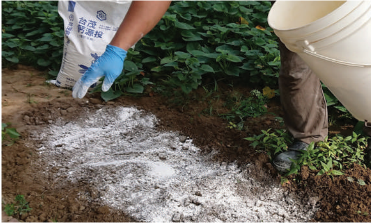
① 1-2 weeks prior to compost or nitrogen fertilizer usage, scatter Calcium Regenerate evenly onto the soil according to recommended usage.

Fertilizer Registration Certificate No.: Fer-Mfg (Micro) No. 0799017